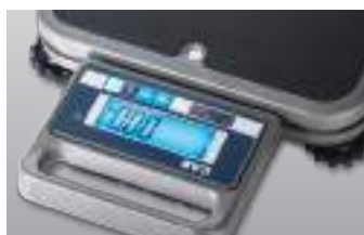
Large LCD with Backlight