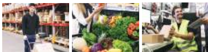
Parcel and Luggage Weighing