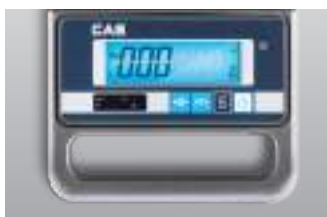
180° Reversible Display