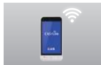
Bluetooth Communication (Option)