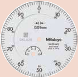
2044S 2044S-60 2044S-09